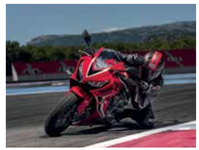
The CBR650R in action.

Honda applied this technology for the first time to its mid-displacement SuperSport motorcycle. The rider can deactivate it on demand.